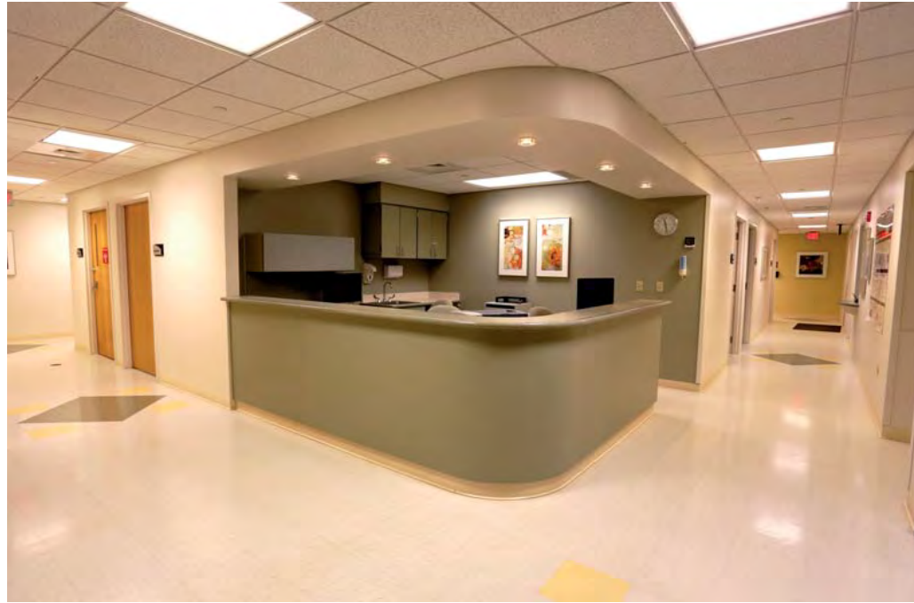
Physicians' Offices and Nurses' Station.